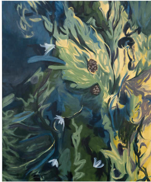
Awakening Pine , 2024, oil on linen, 108cm x 89cm

Additionally, she created a series of 40 watercolors that represent the visual essence and symbolism of each of the 40 identified plants in Botticelli's Primavera , many of which revolve around the theme of love. Malinsky also planted local wildflowers in the NIKI garden to promote pollination and showcase the botanical beauty of spring in May.